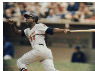
"Hammerin" Hank Aaron (1934—2021)

Thank you for helpful edit suggestions, kind words and actions of support this year and the wonderful opportunity to serve an amazing group! See you on ZOOM in April.