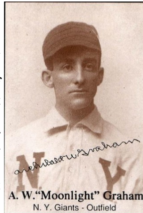
Figure 2. Portrait of Archibald Wright "Moonlight" Graham as member of the 1905 New York Giants.