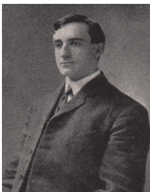
Figure 1. Portrait of Archibald Wright Graham as a medical student at the University of Maryland.

Although Graham played in only one major league ballgame, he enjoyed a successful minor league career that overlapped with his medical training. In 1902, as a medical student, Graham played for Charlotte in the Class C North Carolina League. In 1903, he played for teams in Nashua and Manchester (NH) in the Class B New England League, hitting .240 in 89 games. In 1904, he played the entire season for Manchester, hitting .272 in 108 games. The New York Giants purchased Graham's contract from Manchester on September 15, 1904. Newspaper reports anticipated Graham's joining the team. The February 18, 1905 edition of The Evening World (New York) listed Graham among 19 players on the Giants' roster. The March 13, 1905 edition of the New York Times inaccurately re-