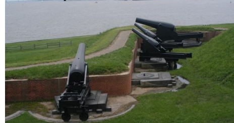
Ft. McHenry looking towards the position of the British ships.

American prisoners being held by the British. Because of the impending attack by the British on Fort McHenry, Key was not allowed to return to his sloop. Thus, his front row seat for the attack and the inspiration for his verse.