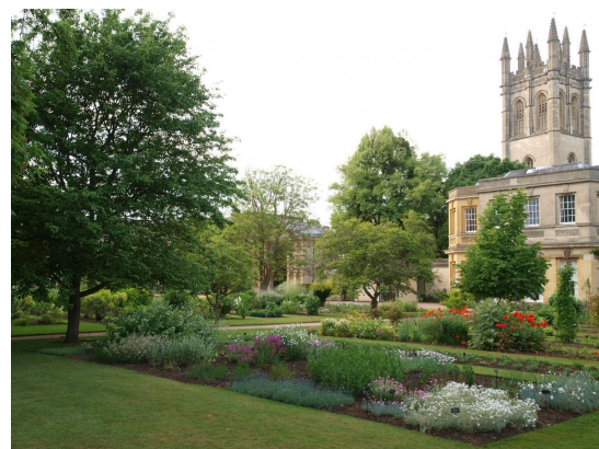
An Oxford Garden near the Library