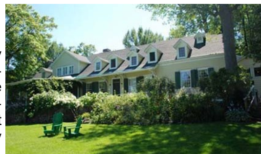
"GREENWOOD" which today has become Greenwood Centre

The Shepherd homes, including "Greenwood", are located in Como (now Hudson) on the south side of the Lake of Two Mountains about 58 km west of Montreal. Many of the houses, including the recently established "Greenwood Centre for Living History," still stand. The Lake, about 2 km. wide at Como, is simply a widening of the Ottawa River (of which more below). In