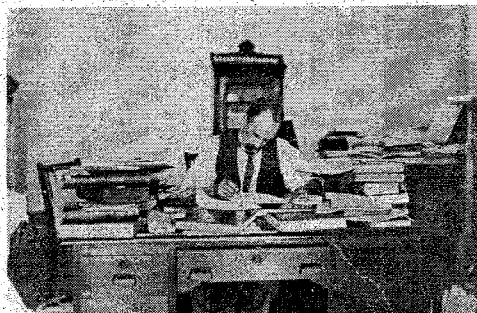
Osler writing Principles and Practice of Medicine (1891). Note the focus and absence of distractions.