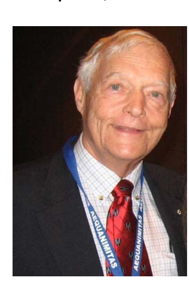
the AOS, installed at the 2011 meeting of the Society at Penn's Landing, Philadelphia

Things to do at the 42d Annual AOS Mtg in Chapel Hill, NC